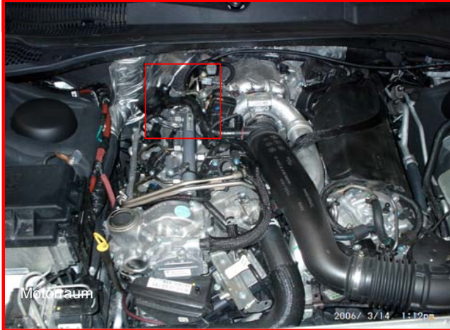
Sensor location 3.0 CRDI