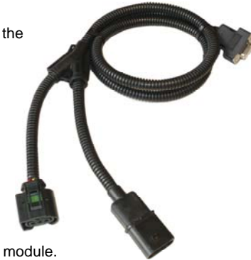
CRD Module CDI1 Adapter