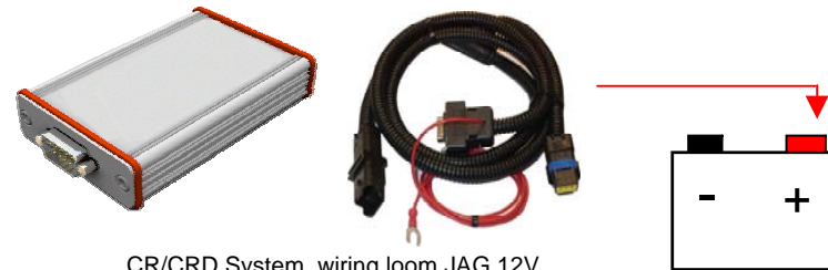
CR/CRD System, wiring loom JAG 12V