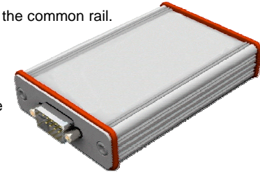
III.3 CR/CRD System Wiring loom JTD1