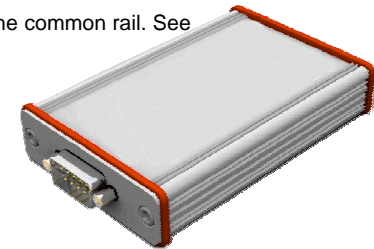
III.3 CR/CRD System Wiring loom FSI-S 12V