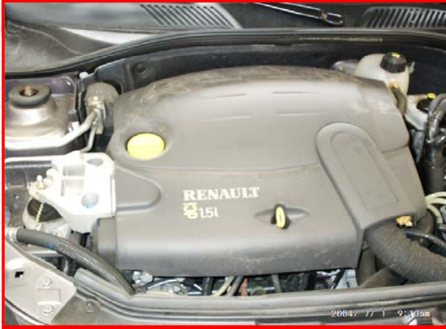
Pressure transducer sensor