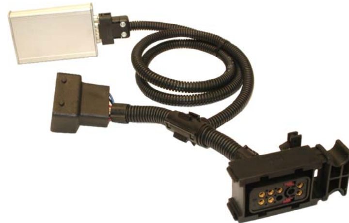
III.4. VPC Modul

Now fit the engine cover back on. The vehicle is now ready for a test drive.