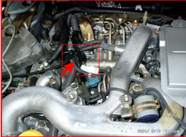
Close up plug (6 Pin) at the common rail strip